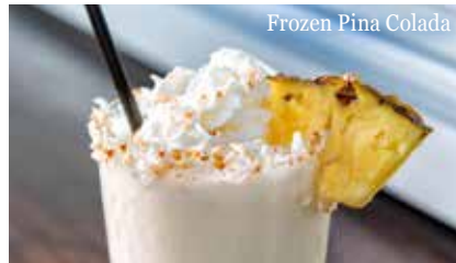
Frozen Pina Colada

Blue Chair Bay Rum, Blue Chair Bay Coconut Rum, just-squeezed lime, pineapple, Grenadine, ginger beer 12