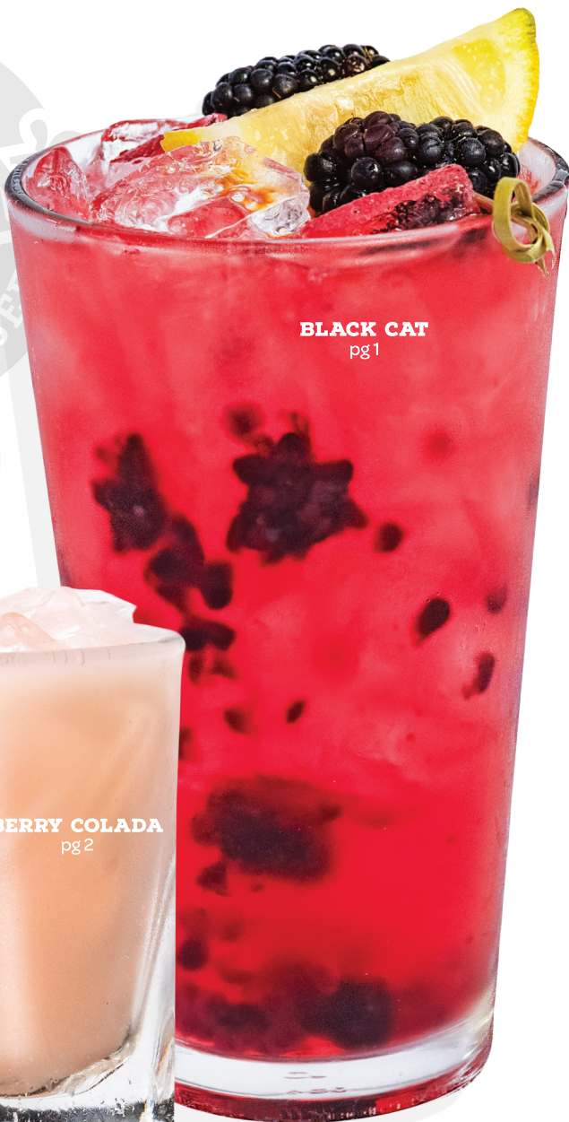
BLACK CAT pg 1