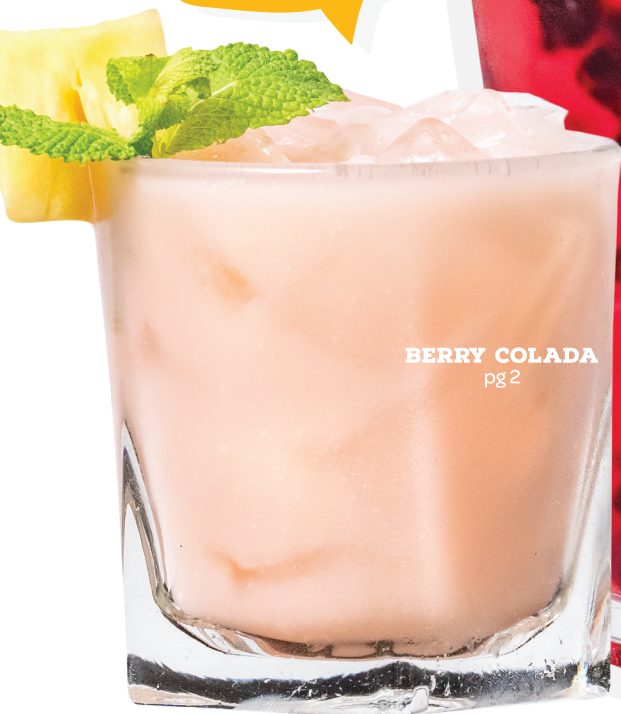
BERRY COLADA pg 2